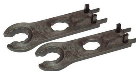
Installation wrench set PV-MS