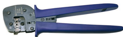
Crimping tool PV-CZM-19100 (2,5 / 4 / 6 mm 2 )