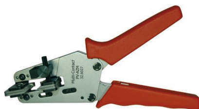
Insulation stripper PV-AZM (1,5 / 2,5 / 4 / 6 mm 2 )